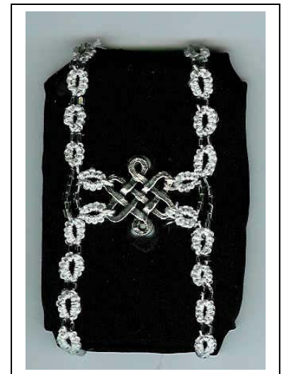
No. 2, A 2.5" long cloth covered tin

joanmariethomas@yahoo.com http://webpages.charter.net/thomasgang/joan.htm