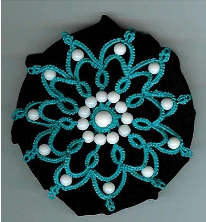
No. 1, A 3" diameter cloth covered tin