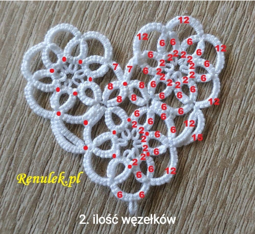
2. ilość węzłków